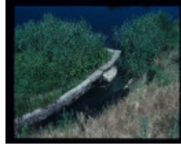
BUCKLEYS FALLS PUMPING STATION