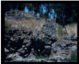
BUCKLEYS FALLS PUMPING STATION