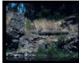
BUCKLEYS FALLS PUMPING STATION