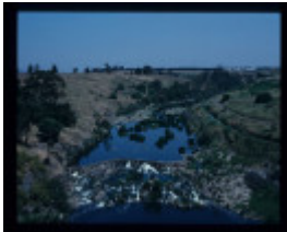
BUCKLEYS FALLS PUMPING STATION