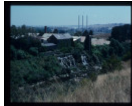
BUCKLEYS FALLS PUMPING STATION