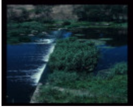
BUCKLEYS FALLS PUMPING STATION