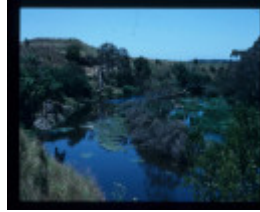
BUCKLEYS FALLS PUMPING STATION