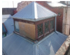
Before Photographs - Reference F3907 2014