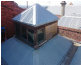
Before Photographs - Reference F3907 2014