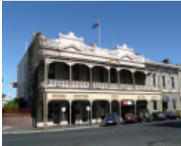
FORMER REIDS COFFEE PALACE SOHE 2008