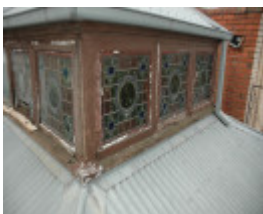
Before Photograph - Reference F3907 2014