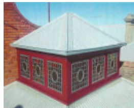
After Photograph - Reference F3907 2016