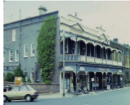
reids coffee palace ballarat side view feb1985