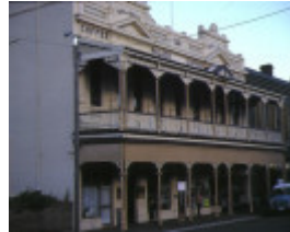
1 reids coffee palace ballarat front view yellow facade