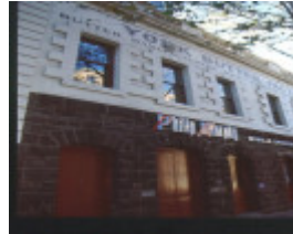
1 former york butter factory h396 facade 2 may2000