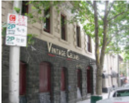
FORMER YORK BUTTER FACTORY SOHE 2008