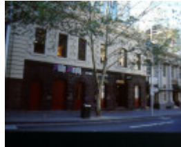
former york butter factory h396 facade may2000