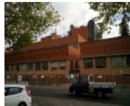
Building N and L, Flecknow Building, E J Barker Building.jpg