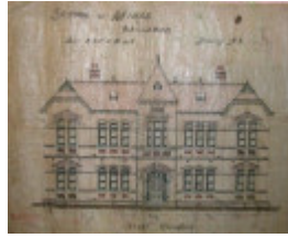
1899, Drawing (front elevation) for Administration Building, former new classrooms building (Building A).jpg