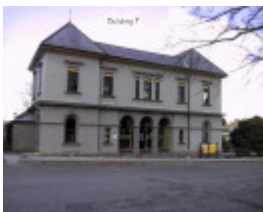
h01463 school of mines lydiard street south ballarat court house bldg f