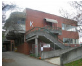
Building K, M B John Building.jpg