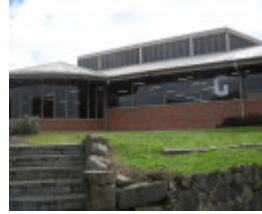
Building G, E J T Tippett Building.jpg