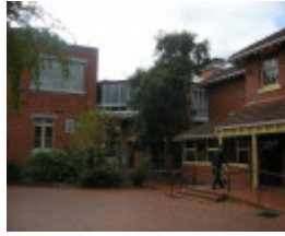
Building B, W J Gribble Building, former School of Technical Art.jpg