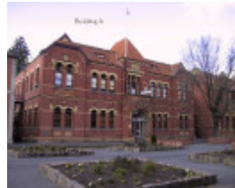
h01463 school of mines lydiard street south ballarat admin bldg a