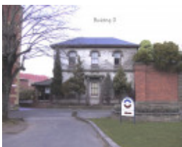
h01463 school of mines lydiard street south ballarat student services bldg d