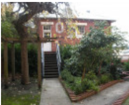
Building O, Old Plumbing Building.jpg