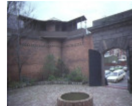
school of mines ballarat courthouse in gaol sep1984