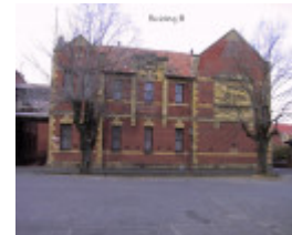
h01463 school of mines lydiard street south ballarat arts bldg b