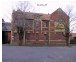
h01463 school of mines lydiard street south ballarat arts bldg b