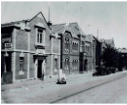
c1950s_School of Mines.jpg