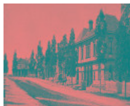
1882_Supreme Court Bldg.jpg