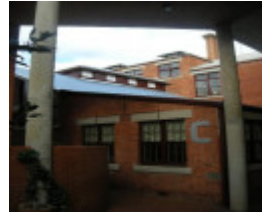
Building C, Old Chemistry Building.jpg