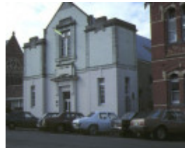
school of mines ballarat former church