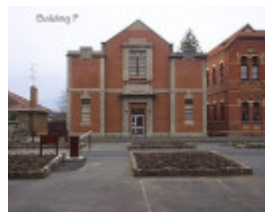
h01463 school of mines lydiard street south ballarat hairdressing bldg p