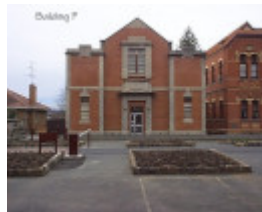
h01463 school of mines lydiard street south ballarat hairdressing bldg p