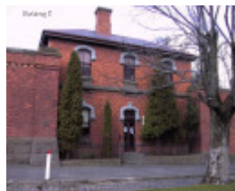
h01463 school of mines lydiard street south ballarat industry training bldg e