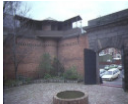
school of mines ballarat courthouse in gaol sep1984