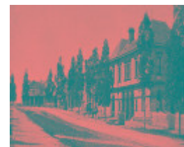
1882_Supreme Court Bldg.jpg