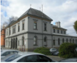
Building F, Former Supreme Court.jpg