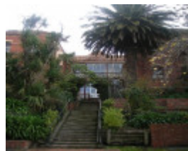
Landscape elements (2).jpg