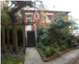
Building O, Old Plumbing Building.jpg