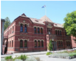
SCHOOL OF MINES SOHE 2008