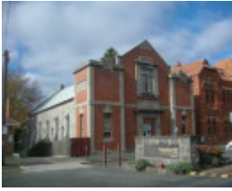
Building P, Former Wesleyan Chapel, later School of Mines Museum..jpg