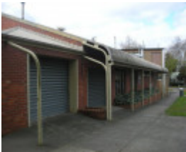
Building H and I, Corbould Building, Automotive Skills Centre.jpg