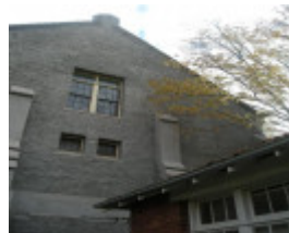
Building P, Former Wesleyan Chapel, later School of Mines Museum (rear).jpg