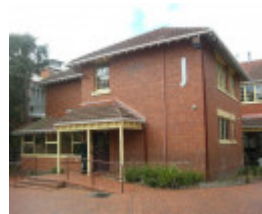
Building J, A W Steane Building (Former Junior Technical School).jpg