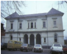
school of mines ballarat former courthouse