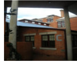
Building C, Old Chemistry Building.jpg