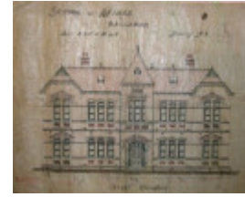
1899, Drawing (front elevation) for Administration Building, former new classrooms building (Building A).jpg