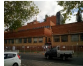
Building N and L, Flecknow Building, E J Barker Building.jpg