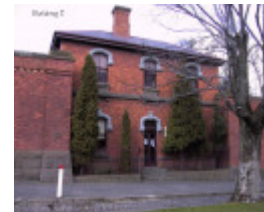
h01463 school of mines lydiard street south ballarat industry training bldg e