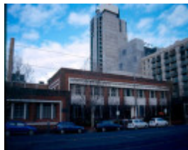
h01507 1 william angliss la trobe street melbourne building