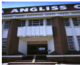
william angliss college la trobe street melbourne front entrance feb1985