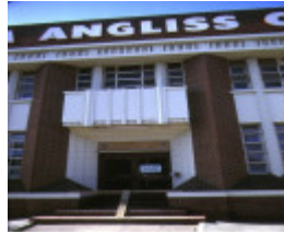
william angliss college la trobe street melbourne front entrance feb1985