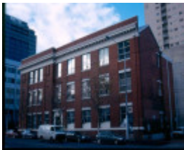
William Angliss College La Trobe Street Melbourne Building B Facade July 2004