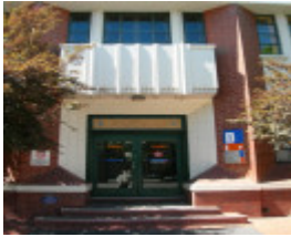
WILLIAM ANGLISS COLLEGE SOHE 2008