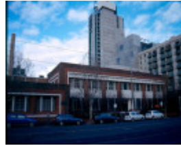
h01507 1 william angliss la trobe street melbourne building