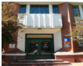
WILLIAM ANGLISS COLLEGE SOHE 2008