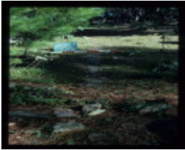
WELSH VILLAGE 30 FEATURE