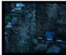
WELSH VILLAGE 30 FEATURE