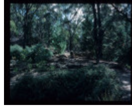
WELSH VILLAGE 30