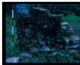
WELSH VILLAGE 30 FEATURE