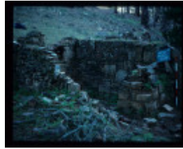
WELSH VILLAGE 30 FEATURE