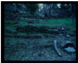
WELSH VILLAGE 30