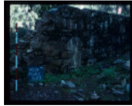
WELSH VILLAGE 30 FEATURE