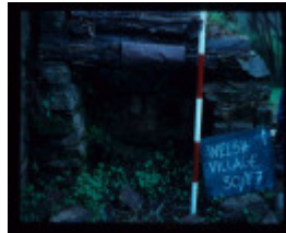
WELSH VILLAGE 30 FEATURE