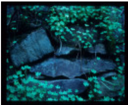
WELSH VILLAGE 30 FEATURE