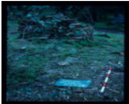
WELSH VILLAGE 30 FEATURE