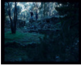
WELSH VILLAGE 30