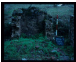
WELSH VILLAGE 30 FEATURE