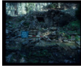
WELSH VILLAGE 30 FEATURE