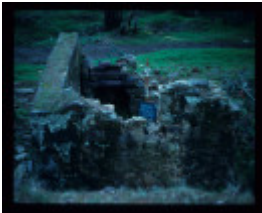
WELSH VILLAGE 30 FEATURE