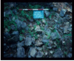
WELSH VILLAGE 30 FEATURE