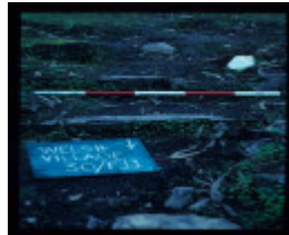
WELSH VILLAGE 30 FEATURE