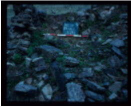
WELSH VILLAGE 30 FEATURE