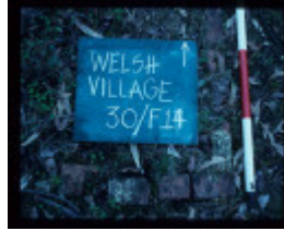
WELSH VILLAGE 30 FEATURE