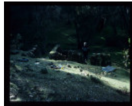
WELSH VILLAGE 30