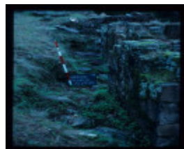
WELSH VILLAGE 30 FEATURE