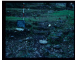
WELSH VILLAGE 30 FEATURE