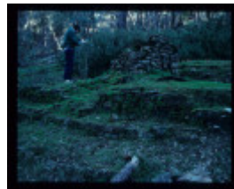
WELSH VILLAGE 30