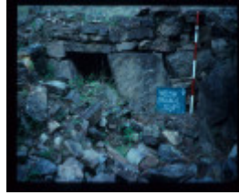
WELSH VILLAGE 30 FEATURE