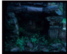
WELSH VILLAGE 30 FEATURE