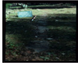
WELSH VILLAGE 30 FEATURE