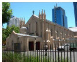
ST FRANCIS CATHOLIC CHURCH SOHE 2008