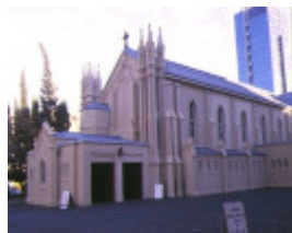
1 st francis catholic church melb east side view