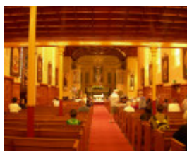
ST FRANCIS CATHOLIC CHURCH SOHE 2008