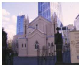
st francis catholic church melb front view