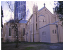
st francis catholic church melb west side view