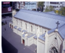
h00013 st francis catholic church lonsdale st melbourne roof she project 2003