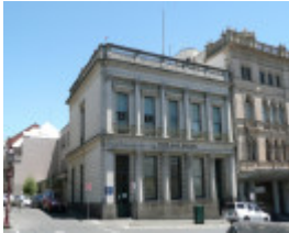
FORMER UNION BANK BUILDING SOHE 2008