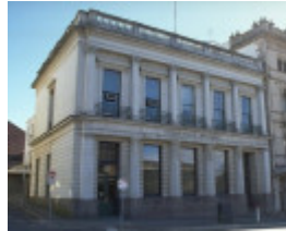
H00109 photo former union bank lydiard st ballarat