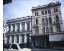
Former Union Bank Building Ballarat Front View