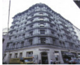
stalbridge chambers little collins street melbourne front elevation may1989