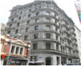
STALBRIDGE CHAMBERS SOHE 2008