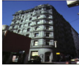
1 stalbridge chambers little collins street melbourne front view jan1979