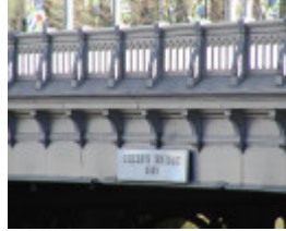
h01448 queens bridge queensbridge street over yarra river melbourne detail view