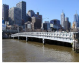
h01448 queens bridge queensbridge street over yarra river melbourne distant view