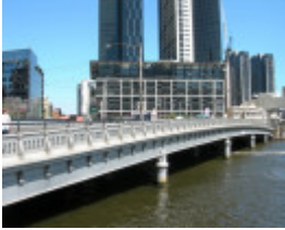
QUEENS BRIDGE SOHE 2008