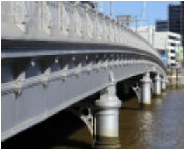
h01448 queens bridge queensbridge street over yarra river melbourne close view