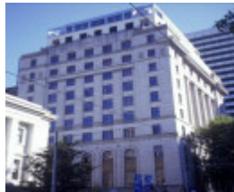
h00965 former port of melbourne authority building exterior she project 2003