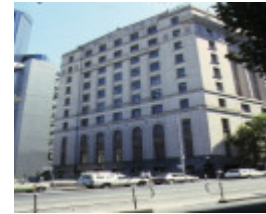
former port of melbourne authority building market street melbourne side view mar1980