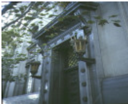
former port of melbourne authority building market street melbourne detail of entry