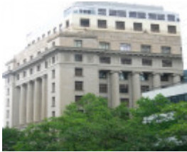
FORMER PORT OF MELBOURNE AUTHORITY BUILDING SOHE 2008