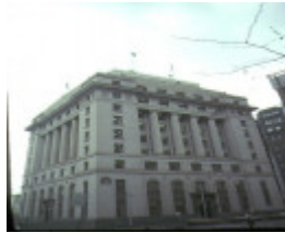
1 former port of melbourne authority building market street melbourne front view sep1978