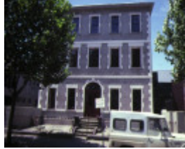
1 former residence queen street melbourne front view jan1985