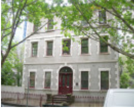
FORMER RESIDENCE SOHE 2008