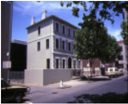
former residence queen street melbourne side view jan1985