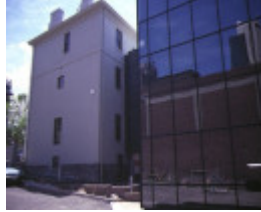
former residence queen street melbourne rear view jan1985