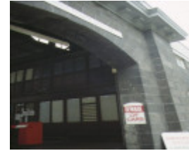
police garage russell street melbourne detail of entrance