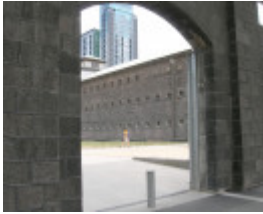
POLICE GARAGE SOHE 2008