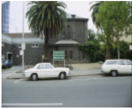
police garage russell street melbourne view of side of building