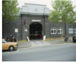
1 police garage russell street melbourne front view of entrance