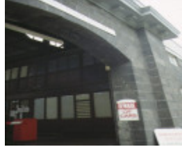
police garage russell street melbourne detail of entrance