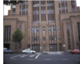
police headquarter's complex russell street melbourne entrance feb1985