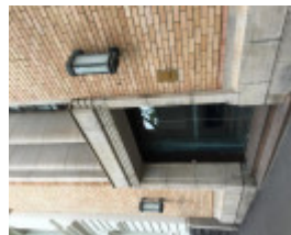
POLICE HEADQUARTERS COMPLEX Nov 2016