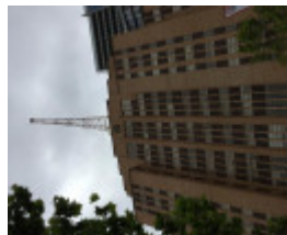
POLICE HEADQUARTERS COMPLEX Nov 2016