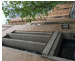
POLICE HEADQUARTERS COMPLEX Nov 2016