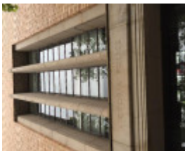
POLICE HEADQUARTERS COMPLEX Nov 2016