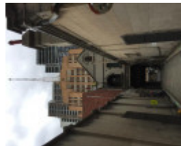
POLICE HEADQUARTERS COMPLEX Nov 2016