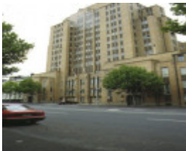
police headquarter's complex russell street melbourne front view