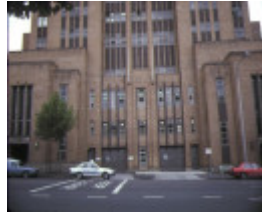
police headquarter's complex russell street melbourne entrance feb1985