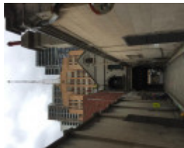
POLICE HEADQUARTERS COMPLEX Nov 2016