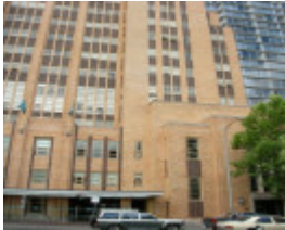
POLICE HEADQUARTERS COMPLEX SOHE 2008