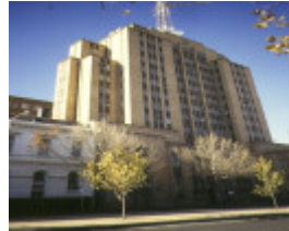
1 police headquarter's complex russell street melbourne front elevation jun1997