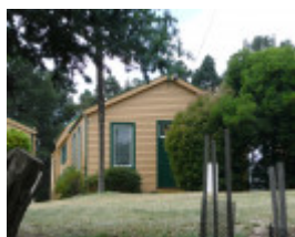
BALLARAT MUNICIPAL OBSERVATORY SOHE 2008