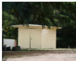
BALLARAT MUNICIPAL OBSERVATORY SOHE 2008