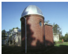
ballarat municipal observatory front view