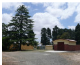
BALLARAT MUNICIPAL OBSERVATORY SOHE 2008