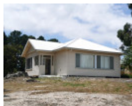
BALLARAT MUNICIPAL OBSERVATORY SOHE 2008