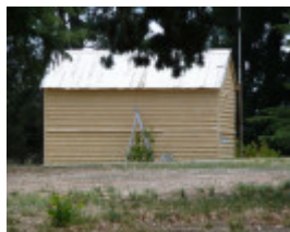
BALLARAT MUNICIPAL OBSERVATORY SOHE 2008