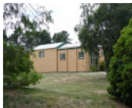
BALLARAT MUNICIPAL OBSERVATORY SOHE 2008