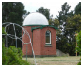
BALLARAT MUNICIPAL OBSERVATORY SOHE 2008