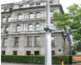
FORMER VICTORIAN RAILWAY HEADQUARTERS SOHE 2008