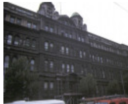
1 former victorian railway headquarters spencer street melbourne vline head office