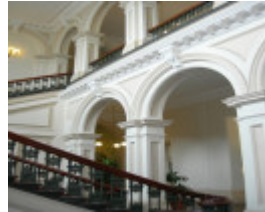
FORMER VICTORIAN RAILWAY HEADQUARTERS SOHE 2008