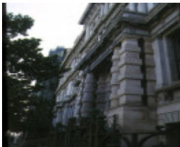
former victorian railway headquarters detail of front pillars