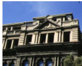
former victorian railway headquarters spencer street melbourne detail of top windows of railway headquarters