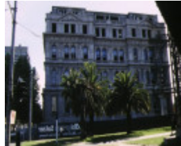
former victorian railway headquarters spencer street melbourne front view railway headquarters