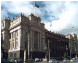
parliament house grounds works & fences spring street melbourne view from spring street