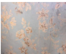
Photo_1.JPG Sample of remnant original wall finish to Room1.138 (south west wing) dating to 1880-81.