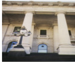
parliament house grounds works & fences spring street melbourne front column elevation