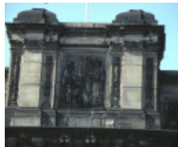
parliament house grounds works & fences spring street melbourne relief detail