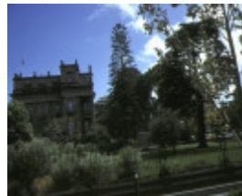
parliament house grounds works & fences spring street melbourne grounds feb1985