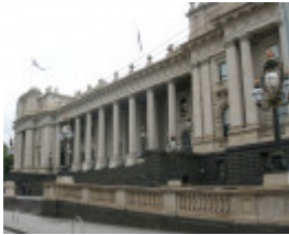
PARLIAMENT HOUSE (INCLUDING GROUNDS, WORKS AND FENCES) SOHE 2008