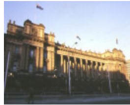
1 parliament house grounds works & fences spring street melbourne front view