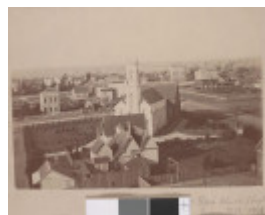
Bowling Green site: St Peter's and Manse