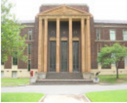
ROYAL AUSTRALIAN COLLEGE OF SURGEONS July 2016