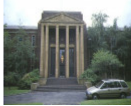
1 royal australasian college of surgeons spring street melbourne administration building facade