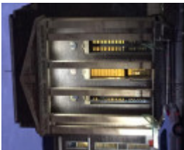
ROYAL AUSTRALIAN COLLEGE OF SURGEONS July 2016