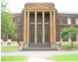
ROYAL AUSTRALIAN COLLEGE OF SURGEONS July 2016