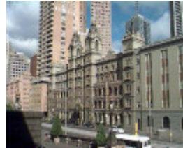
hotel windsor spring street melbourne front elevation