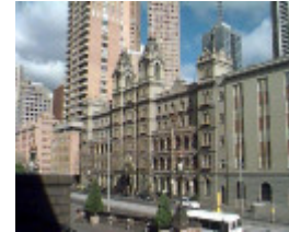
hotel windsor spring street melbourne front elevation