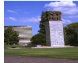
shrine of remembrance st kilda road melbourne ww2 memorial