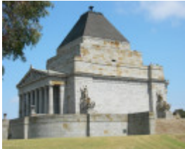
SHRINE OF REMEMBRANCE SOHE 2008