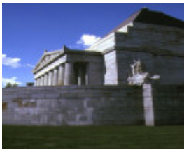
shrine of remembrance st kilda road melbourne side elevation