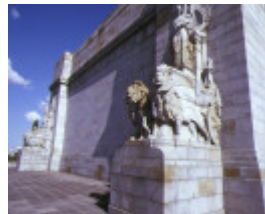
shrine of remembrance st kilda road melbourne side view with lions