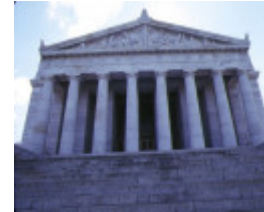
shrine of remembrance st kilda road melbourne front view of columns