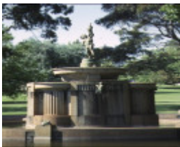
shrine of remembrance st kilda road melbourne macrobertson fountain nov1990