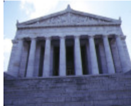
shrine of remembrance st kilda road melbourne front view of columns