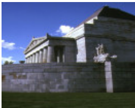
shrine of remembrance st kilda road melbourne side elevation