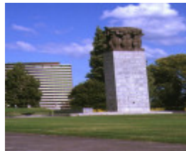
shrine of remembrance st kilda road melbourne ww2 memorial