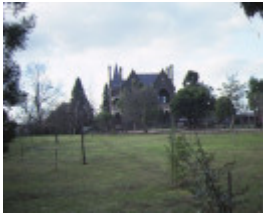
1 bishops palace ballarat view of property aug1985