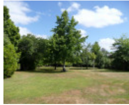
BISHOPS PALACE SOHE 2008