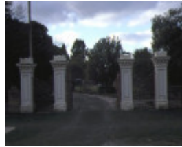
bishops palace ballarat gate aug1985