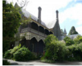
BISHOPS PALACE SOHE 2008