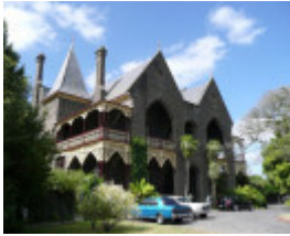
BISHOPS PALACE SOHE 2008