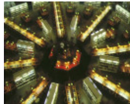
state library of victoria & national museum complex domed reading room feb1998