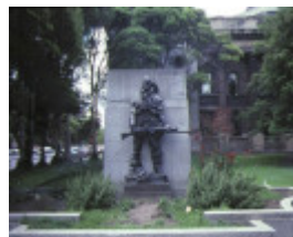
state library of victoria & national museum complex war statue on la trobe street corner jan1985