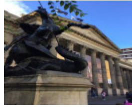
STATE LIBRARY OF VICTORIA July 2016