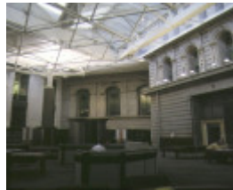
state library of victoria & national museum complex covered courtyard feb1998