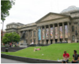
STATE LIBRARY OF VICTORIA SOHE 2008