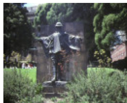
state library of victoria & national museum complex war statue jan1985