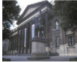
State Library of Victoria and Museums Complex, 1985, showing building facade with the statue of St Joan of Arc in the foreground