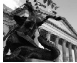
STATE LIBRARY OF VICTORIA July 2016