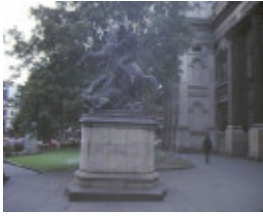
state library of victoria & national museum complex statue of st george & the dragon jan 1985