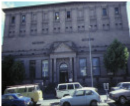
state library of victoria & national museum complex museum entrance russell street jan1985