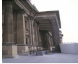
1 state library of victoria & national museum complex entrance feb1998