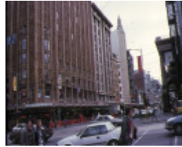
capitol house swanston street melbourne street view