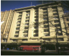
1 capitol house swanston street melbourne front elevation jun1997