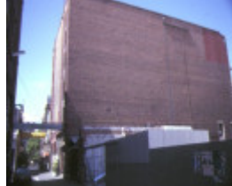
storey hall swanston street melbourne rear elevation