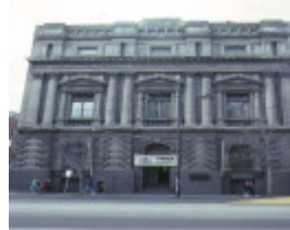
1 storey hall swanston street melbourne front elevation