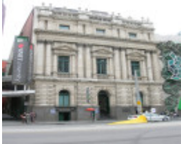
STOREY HALL SOHE 2008