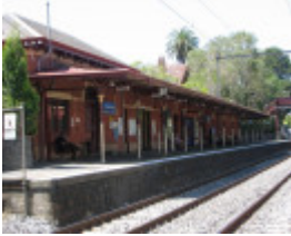
MIDDLE BRIGHTON RAILWAY STATION COMPLEX SOHE 2008