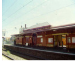
1 middle brighton railway station upside platform building sw nov1998