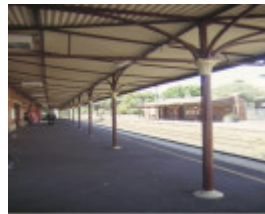
middle brighton railway station church street brighton verandah nov1998