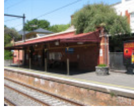
MIDDLE BRIGHTON RAILWAY STATION COMPLEX SOHE 2008