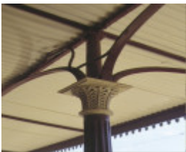
middle brighton railway station church street brighton verandah detail nov1998