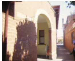
middle brighton railway station church street brighton street entry nov1998