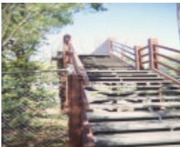
middle brighton railway station church street brighton footbridge nov1998