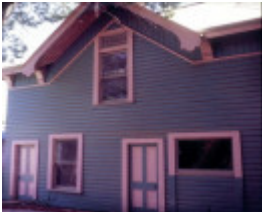
h00729 rio vista currton avenue mildura miner's cottage she project 2003