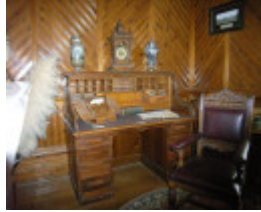
RIO VISTA SOHE 2008