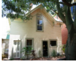
RIO VISTA SOHE 2008