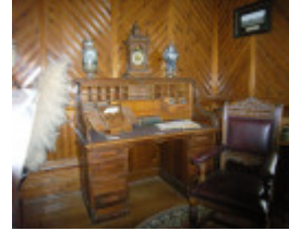
RIO VISTA SOHE 2008