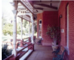
h00729 rio vista currton avenue mildura verandah she project 2003