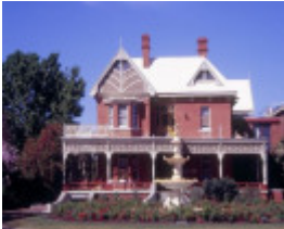
h00729 1 rio vista currton avenue mildura front she project 2003