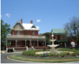
RIO VISTA SOHE 2008