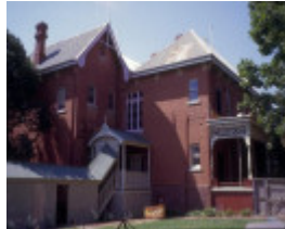
h00729 rio vista currton avenue mildura back corner she project 2003