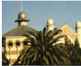
methodist church cnr deakin avenue & tenth street mildura view of roof line jun1980