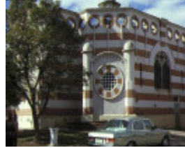
1 methodist church cnr deakin avenue & tenth street mildura side view