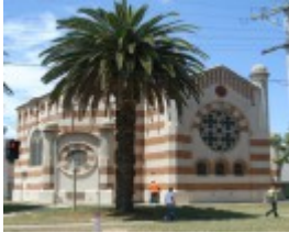
METHODIST CHURCH SOHE 2008