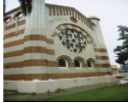
methodist church cnr deakin avenue & tenth street mildura exterior window sep1992