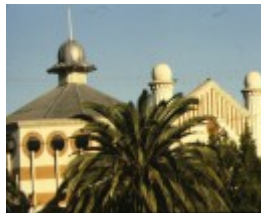
methodist church cnr deakin avenue & tenth street mildura view of roof line jun1980