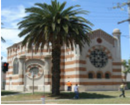
METHODIST CHURCH SOHE 2008