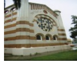
methodist church cnr deakin avenue & tenth street mildura exterior window sep1992