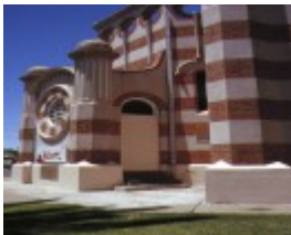
methodist church cnr deakin avenue & tenth street mildura rear entrance nov1989