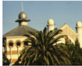
methodist church cnr deakin avenue & tenth street mildura view of roof line jun1980