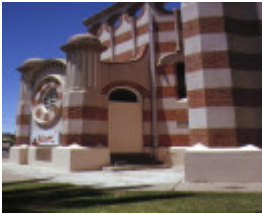
methodist church cnr deakin avenue & tenth street mildura rear entrance nov1989