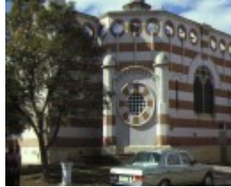
1 methodist church cnr deakin avenue & tenth street mildura side view