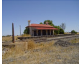
Minyip Railway Station February 2006