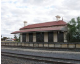
MINYIP RAILWAY STATION SOHE 2008