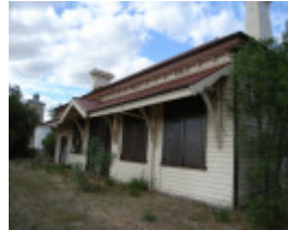
MINYIP RAILWAY STATION SOHE 2008