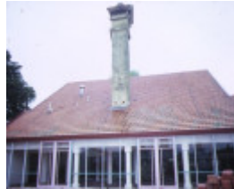
walter burley griffin incinerator holmes rd moonee ponds side view sep1985