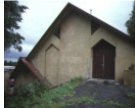
walter burley griffin incinerator holmes road moonee ponds entrance sep1985