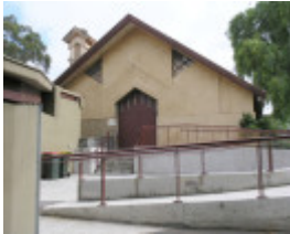
ESSENDON INCINERATOR COMPLEX SOHE 2008