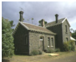
former moorabool railway station front view dec1998