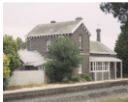
1 former moorabool railway station platform view dec1998