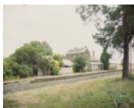
former moorabool railway station streetscape dec1998