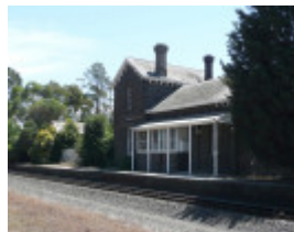
FORMER MOORABOOL RAILWAY STATION SOHE 2008