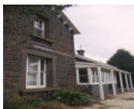
former moorabool railway station track side dec1998