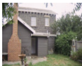
former moorabool railway station rear view dec1998