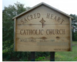
Sacred Heart Catholic Church, 70 High Street, Inverleigh