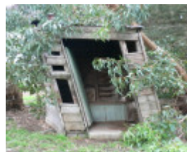
Sacred Heart Catholic Church, 70 High Street, Inverleigh