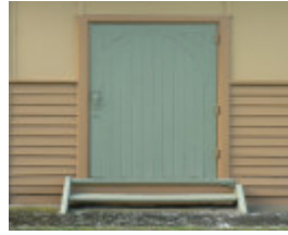
Sacred Heart Catholic Church, 70 High Street, Inverleigh