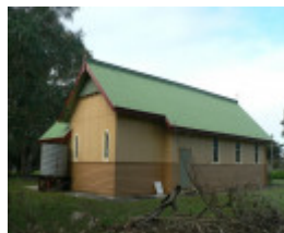
Sacred Heart Catholic Church, 70 High Street, Inverleigh