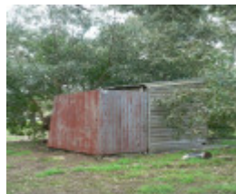
Sacred Heart Catholic Church, 70 High Street, Inverleigh