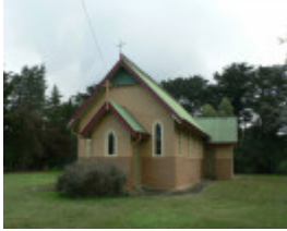
Sacred Heart Catholic Church, 70 High Street, Inverleigh