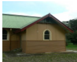
Sacred Heart Catholic Church, 70 High Street, Inverleigh