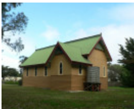
Sacred Heart Catholic Church, 70 High Street, Inverleigh