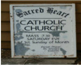
Sacred Heart Catholic Church, 70 High Street, Inverleigh