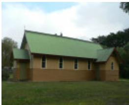
Sacred Heart Catholic Church, 70 High Street, Inverleigh