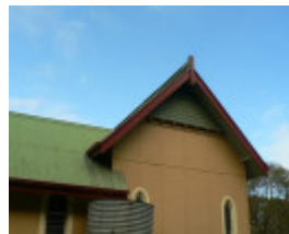
Sacred Heart Catholic Church, 70 High Street, Inverleigh