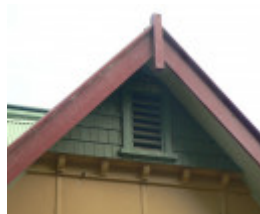
Sacred Heart Catholic Church, 70 High Street, Inverleigh