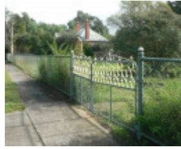
Sacred Heart Catholic Church, 70 High Street, Inverleigh