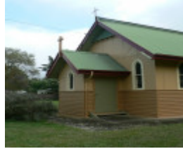
Sacred Heart Catholic Church, 70 High Street, Inverleigh