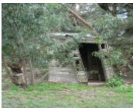
Sacred Heart Catholic Church, 70 High Street, Inverleigh