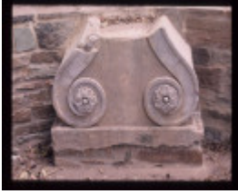
FORMER GOVERNMENT CAMP PRECINCT (ROSALIND PARK) EXCAVATION