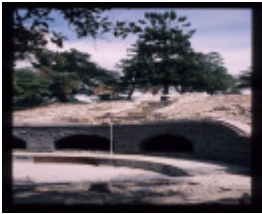
FORMER GOVERNMENT CAMP PRECINCT (ROSALIND PARK) EXCAVATION