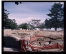
FORMER GOVERNMENT CAMP PRECINCT (ROSALIND PARK) EXCAVATION