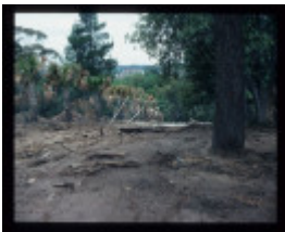
FORMER GOVERNMENT CAMP PRECINCT (ROSALIND PARK) EXCAVATION