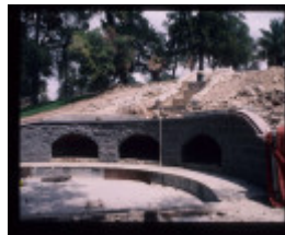
FORMER GOVERNMENT CAMP PRECINCT (ROSALIND PARK) EXCAVATION