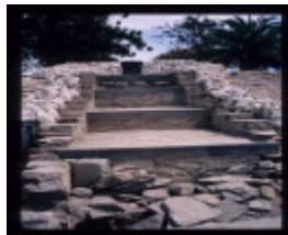
FORMER GOVERNMENT CAMP PRECINCT (ROSALIND PARK) EXCAVATION