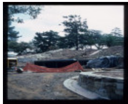
FORMER GOVERNMENT CAMP PRECINCT (ROSALIND PARK) EXCAVATION