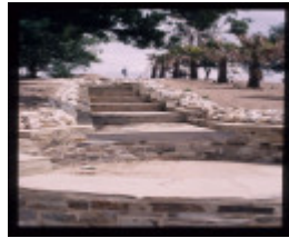
FORMER GOVERNMENT CAMP PRECINCT (ROSALIND PARK) EXCAVATION