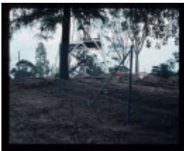
FORMER GOVERNMENT CAMP PRECINCT (ROSALIND PARK) EXCAVATION