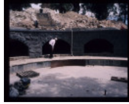
FORMER GOVERNMENT CAMP PRECINCT (ROSALIND PARK) EXCAVATION