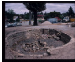
FORMER GOVERNMENT CAMP PRECINCT (ROSALIND PARK) EXCAVATION