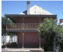
day's flour mill complex murchison side view of homestead