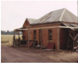
day's flour mill complex murchison gate lodge