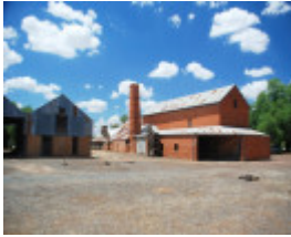
DAY'S FLOUR MILL COMPLEX SOHE 2008