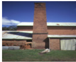
day's flour mill complex murchison chimney nov1984