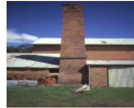
day's four mill complex murchison chimney nov1984