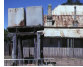
day's flour mill complex murchison corrugated iron building