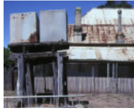
day's flour mill complex murchison corrugated iron building