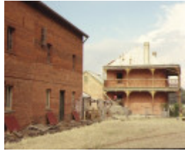
1 day's flour mill complex murchison mill & homestead