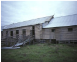
dhurringile prison murchison woolshed side view aug1984