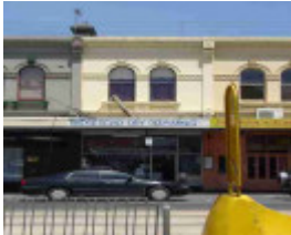
richmond bridge road richmond bridge road 362