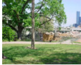
h02009 js 10 nov 2003 southern elm during demolition