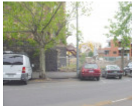
h02009 mornington wall 3 nov 2003