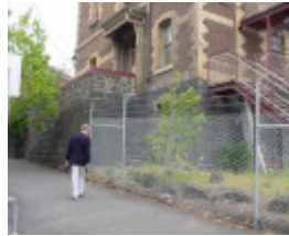
h02009 mornington wall 1 nov 2003