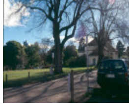
H02009 1 jolimont square h2009