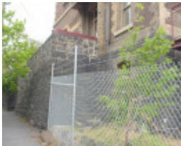
h02009 mornington wall 2 nov 2003