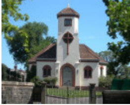
JOLIMONT SQUARE SOHE 2008