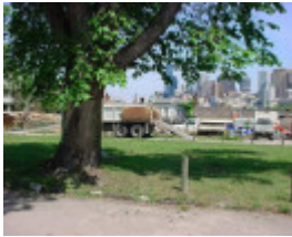
h02009 js demolition 10 nov 2003