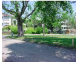
h02009 js trees during demolition 10 nov 2003