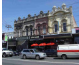
Richmond Bridge Road 138- 144.JPG