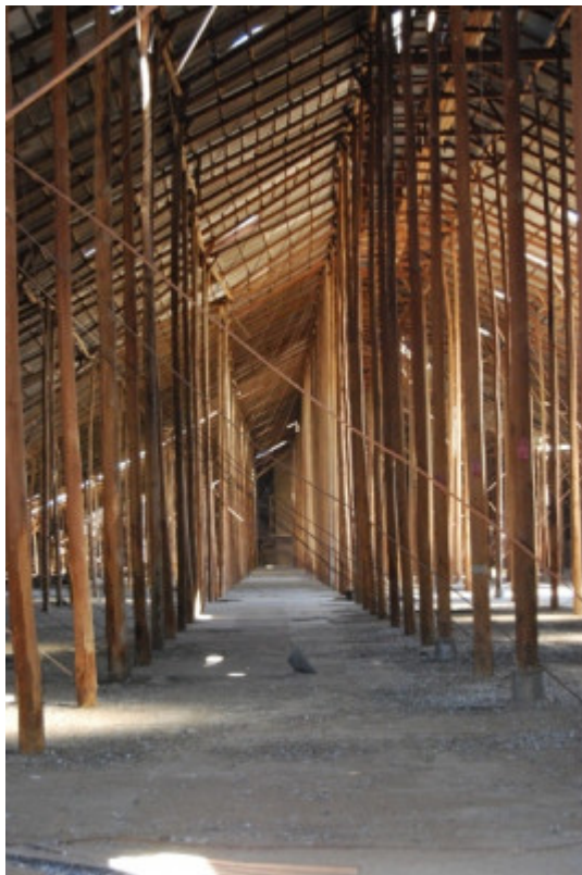
Murtoa Grain Store interior Nov 08 01