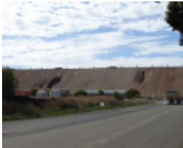
MARMALAKE/MURTOA GRAIN STORE SOHE 2008