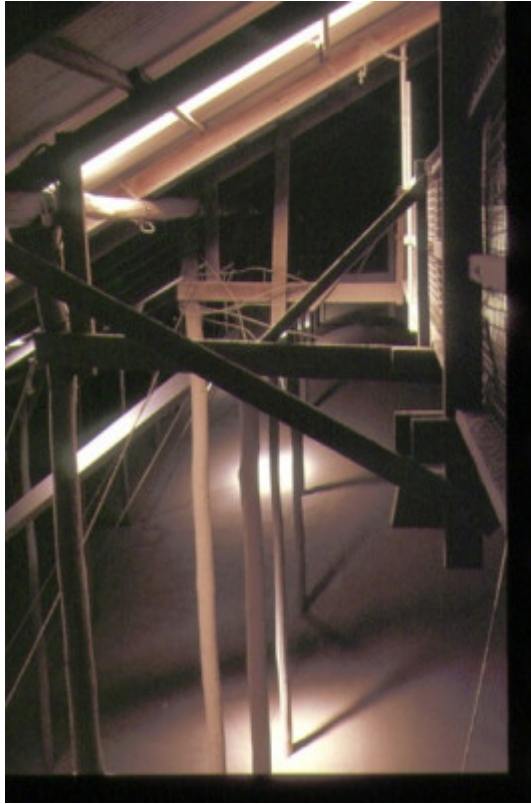
murtoa grain store wimmera hwy murtoa interior rafters