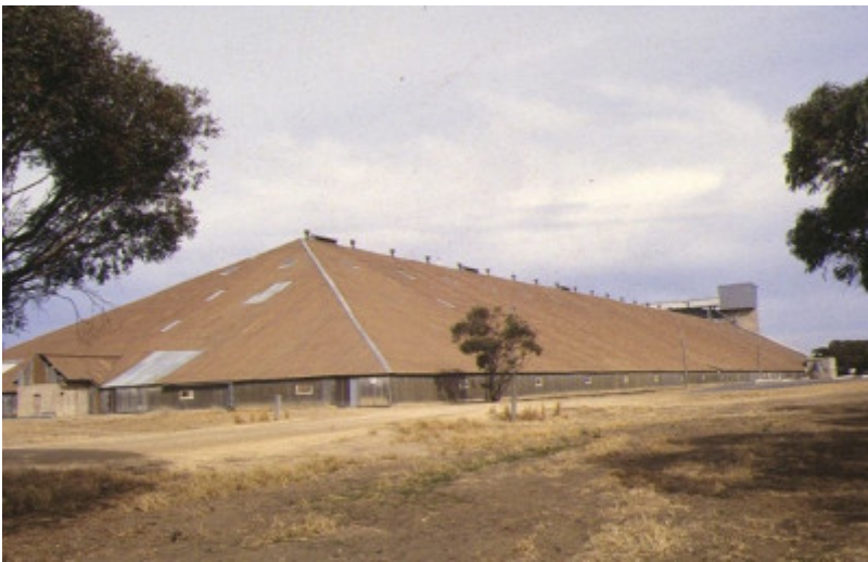
murtoa grain store wimmera hwy murtoa site view