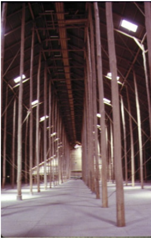
murtoa grain store wimmera hwy murtoa interior from ground view