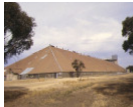
murtoa grain store wimmera hwy murtoa site view