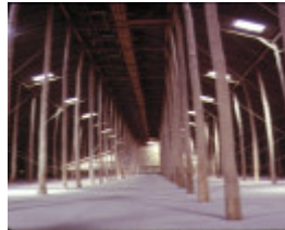
murtoa grain store wimmera hwy murtoa interior from ground view