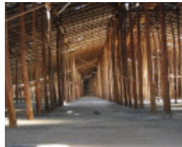
Murtoa Grain Store interior Nov 08 01