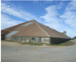
MARMALAKE/MURTOA GRAIN STORE SOHE 2008