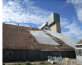
MARMALAKE/MURTOA GRAIN STORE SOHE 2008