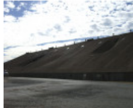
MARMALAKE/MURTOA GRAIN STORE SOHE 2008