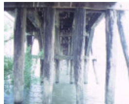
chinamans bridge over goulburn river negambie pylons dec1987