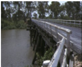
chinamans bridge over goulburn river nagambie siding detail dec1987