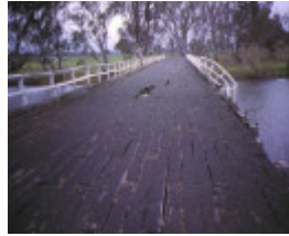
chinamans bridge over goulburn river nagambie carriageway jun1998