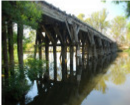
CHINAMANS BRIDGE SOHE 2008