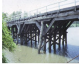
1 chinamans bridge over goulburn river nagambie side elevation dec1987