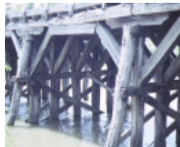
chinamans bridge over goulburn river negambie side detail dec1987