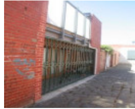
Rear 19 Amess Street.JPG