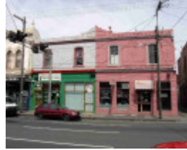
Collingwood Johnston Street 85-91.JPG