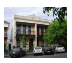
Richmond Erin Street 21-23.JPG