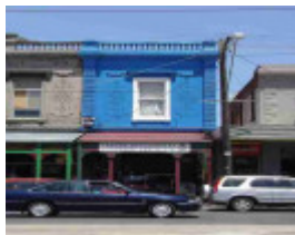
richmond bridge road richmond bridge road 398