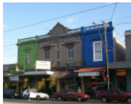
Bridge Rd 400 18239.JPG