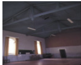
former baptist church aberdeen street newtown interior