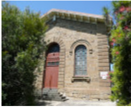
FORMER BAPTIST CHURCH SOHE 2008