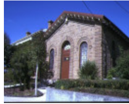
former baptist church aberdeen street newtown chapel front view