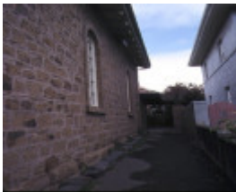
former baptist church aberdeen street newtown side view