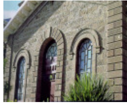
former baptist church aberdeen street newtown front elevation publication