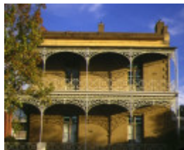
armytage house pakington street newtown side view 1997