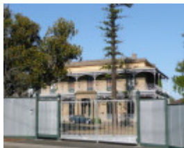
ARMYTAGE HOUSE SOHE 2008