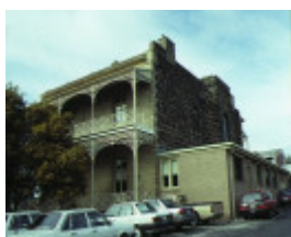
armytage house pakington street newtown rear view