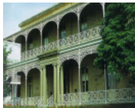
armytage house pakington street newtown front elevation publication