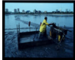
ALBERT PARK LAKE EXCAVATION