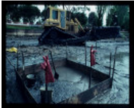
ALBERT PARK LAKE EXCAVATION