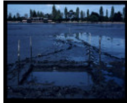
ALBERT PARK LAKE EXCAVATION