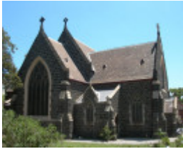
ST MARYS CHURCH OF ENGLAND SOHE 2008