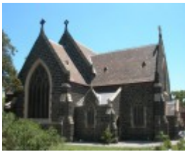
ST MARYS CHURCH OF ENGLAND SOHE 2008