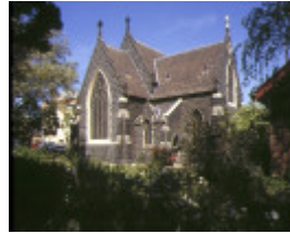
st mary's church of england howard street north melbourne side elevation oct1997