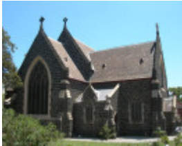
ST MARYS CHURCH OF ENGLAND SOHE 2008