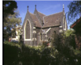
st mary's church of england howard street north melbourne side elevation oct1997