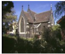
st mary's church of england howard street north melbourne side elevation oct1997