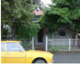
abbotsford charles street abbotsford charles street 124