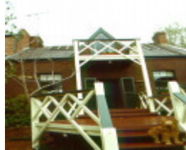
596 queensbury street rear august 2000