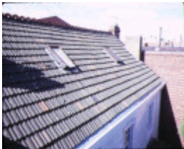
456 victoria street nth melb roof front