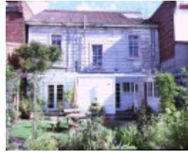
456 victoria street nth melb back view