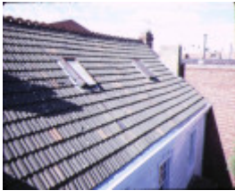
456 victoria street nth melb roof front