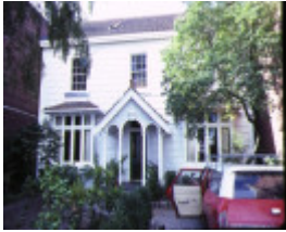
1 456 victoria street nth melb front view