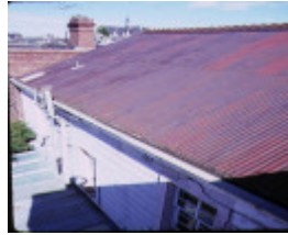
456 victoria street nth melb roof back