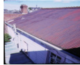
456 victoria street nth melb roof back